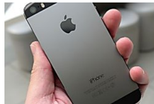
Experts shocked, as new trick saves online shoppers thousands in MegaBargain 24