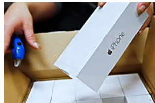
Please Don't Pay Full Price for iPhones. Here's Why MegaBargain 24