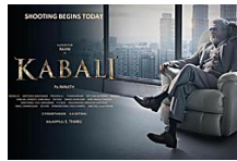
'Kabali' Teaser: Rajinikanth Wows Fans With