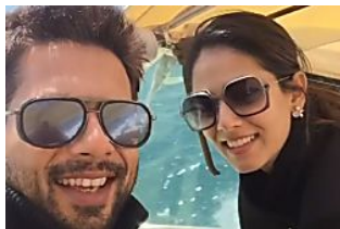
Photos of Shahid Kapoor and Mira Rajput's babymoon are making Itripto