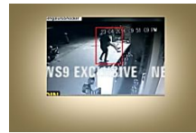
Bengaluru Woman Abducted,