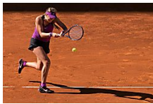
Victoria Azarenka Beats Cornet to