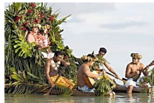
Top 10 Amazing Wedding Destinations in the World | Love and Love and Mind