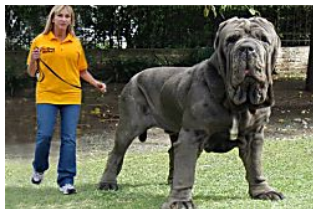
Biggest Dogs in the World, What they Do and #5 will leave you The Biggest Birds