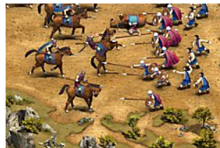
15 million players are already addicted! Forge Of Empires