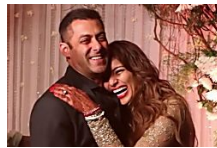
Salman's Wedding Queries to Bipasha-